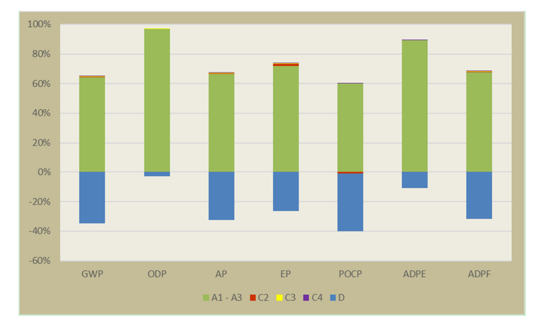
Figure 3 LCA results for the pre-finished steel

The primary site emissions come from the use of coal and coke in the blast and basic oxygen furnaces as well as combustion of the process gases. These processes give rise to emissions of CO<sub>2</sub>, which contributes 94% of the Global Warming Potential (GWP), and sulphur oxides, which are responsible for almost two thirds of the impact in the Acidification Potential (AP) category. In addition, oxides of nitrogen are emitted which contribute one third of the A1-A3 Acidification Potential, and almost 80% of the Eutrophication Potential (EP), and the combined emissions of sulphur and nitrogen oxides, together with a relatively large emission of carbon monoxide, all contribute to the Photochemical Ozone indication (POCP).